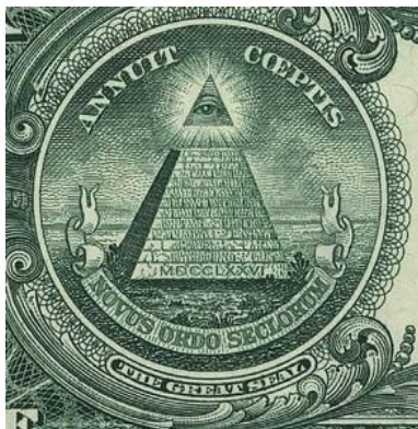
Detail of a 1-dollar bill, USA