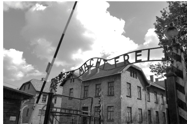
Auschwitz concentration camp

After sufficient self-punishment, one gives oneself inner permission to continue indulging in the undesirable behavior. So the opposite of what was intended happens: the undesirable behaviour is stabilized instead of overcome. Feelings of guilt are an unsuitable instrument for changing behavior. The one who is immune to fascism is not the one who claims to be an anti-fascist with his mouth, but the one who no longer seeks superiority in his heart. The desire for superiority is based on feelings of inferiority, which in turn are rooted in fear. And this is where we find the German shadow, which the whole world