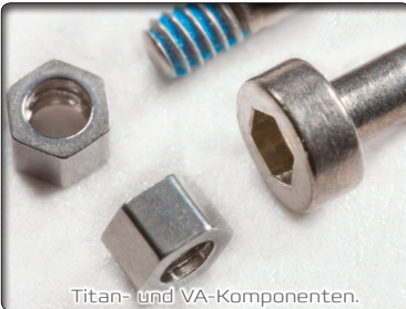
Titan- und VA-Komponenten.