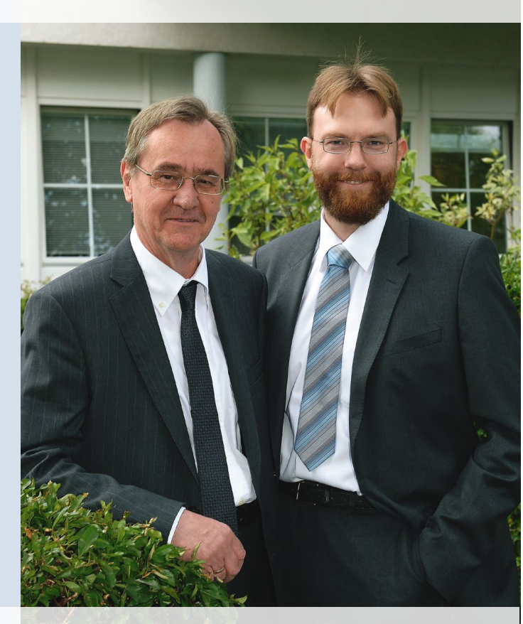
Your service partner in the Frankfurt-Rhine-Main area