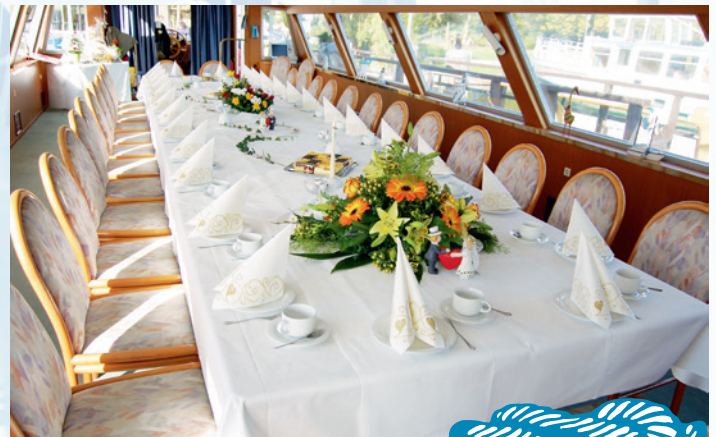
Illustration: decoration package bookable