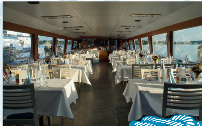
Illustration: decoration package bookable